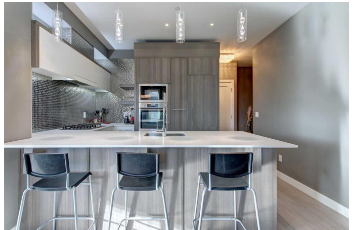
308-119 19 St NW, Calgary, AB

Welcome to Savoy by Truman Homes, where urban convenience meets contemporary style! Nestled in the heart of Kensington West, this vibrant community offers an incredible lifestyle—step outside to explore charming boutique shops, restaurants, bistros, and delis. Enjoy easy access to transit, the Bow River pathways, Kensington Village, and downtown, plus a well-established neighborhood with schools, parks, playgrounds, and more! This bright and unique corner unit boasts south east-facing exposures, flooding your space with natural light. Step into a welcoming entryway with a closet, leading you to a sleek, modern kitchen featuring high-end appliances, quartz countertops, and custom cabinets. The open layout flows effortlessly into the dining and living areas, the perfect spot to relax, with access to the south-facing balcony. The spacious primary bedroom features a luxury ensuite pampering you with a deep soaker tub, a large standing shower, and a stunning Kohler glass vessel sink. The flexible second bedroom is thoughtfully placed on the other side of the unit for added privacy. The spa-inspired main bathroom includes a huge walk-in shower and stylish glass vessel sink. Plus, the in-suite laundry offers additional storage and organization. Enjoy the added perks of a rooftop patio, secure titled underground parking, a separate storage locker, and bicycle storage. This stunning home is move-in ready—come experience the best of Kensington living today!