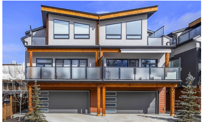
UNIT 1 AT 826 7TH STREET IN CANMORE ALBERTA

With four spacious bedrooms and four luxurious bathrooms, this home is designed for comfort and convenience. Three of the bedrooms feature their own ensuites, ensuring privacy and luxury for each resident or guest. Whether you're waking up to a mountain