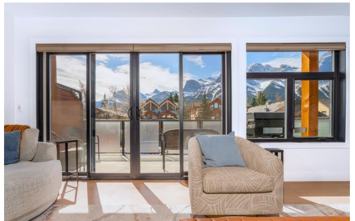
NO MATTER WHERE YOU SIT THE VIEW WILL TAKE YOUR BREATH AWAY!